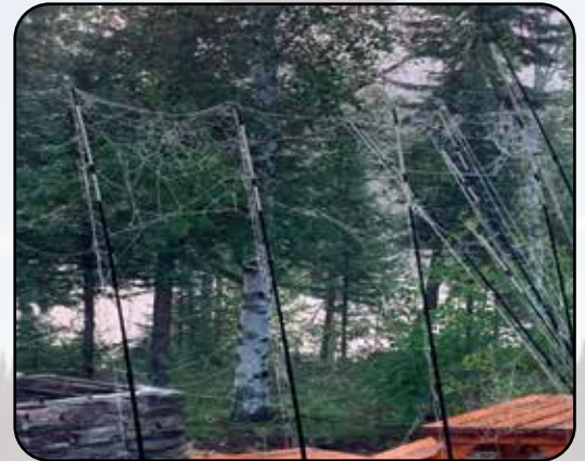
Rental tackle sits unused at Laurie River Lodge in June of 2021. Notice the spider webs running between the tips of the rods.

One of the last things I do each spring, just prior to the first guests arrival, is to setup my supply of rental rods and reels for the incoming guests. I re-spool each reel with the appropriate weight of line, carefully affix it to the proper rod and normally finish the deal by tying a de-barbed jig to the Walleye rods or a 30 lb test leader to the Pike rods. There is something satisfying about seeing the rod holders on the front of the Main Lodge deck filled with quality fishing equipment, the place just doesn't look right without it. I guess that is why I took the time in the spring of 2020 to setup our rental gear and put it out on the deck, knowing full well that, thanks to COVID - 19 and the resulting border closures, there was little likelihood of us having customers until mid-season at the earliest. It was a couple of weeks later that I was enjoying an early morning coffee on the deck when I noticed that some opportunistic spider (or spiders) had taken advantage of my unused rental rods to help hold up a very intricately designed web. I could not help but think to myself that I was glad someone (or something) was getting some use out of those rods.